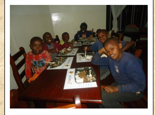
Love the placemats; they make dinner a little more fun!

Our Guest Manual is attached to this email, which offers quite a bit of information.